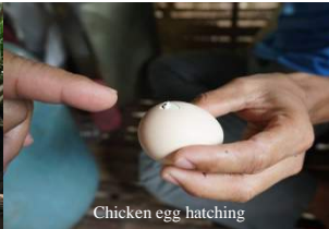
Chicken egg hatching